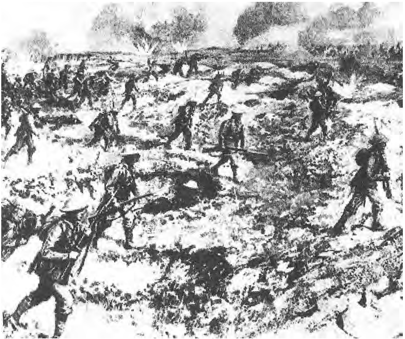
17 Trench warfare