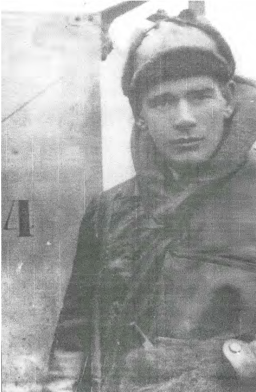
20 Mick Mannock