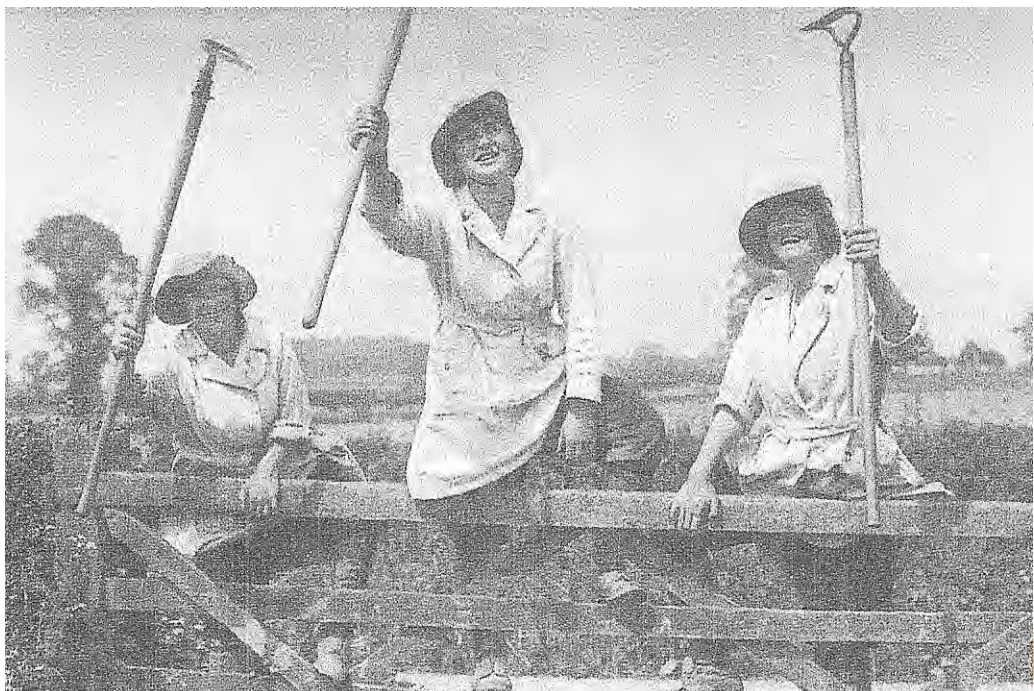
18 Women's Land Army

Food shortages were not a major problem in Britain initially. A bigger problem was rising prices because the government restricted the amount of food and other goods which could be imported.. Following a poor harvest in 1916 (5. p140), the situation deteriorated in 1917 when the Germans adopted a tactic of unrestricted submarine warfare. Essential supplies ran out and in April 1917 Britain was six weeks away from running out of wheat. In order to release men and increase the work force and home farming acreage, the Women's Land Army was formed in February 1917. (8.). 10% of the WLA were to be employed in Kent. Another way of releasing men was the formation in 1917 of the Royal Defence Corps of soldiers too old for the front. This anticipated The Home Guard of 1940. (9.)