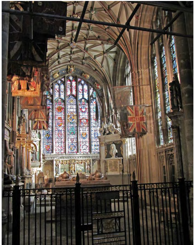
22 Warriors' chapel Canterbury Cathedral

During the Great War eight battalions of the (Canterbury based) Buffs regiment went on active service and another seven served at home. No less than 33,000 men passed through the ranks of the regiment of whom some 6,000 died; forty-eight battle honours were awarded and one VC. (10.)