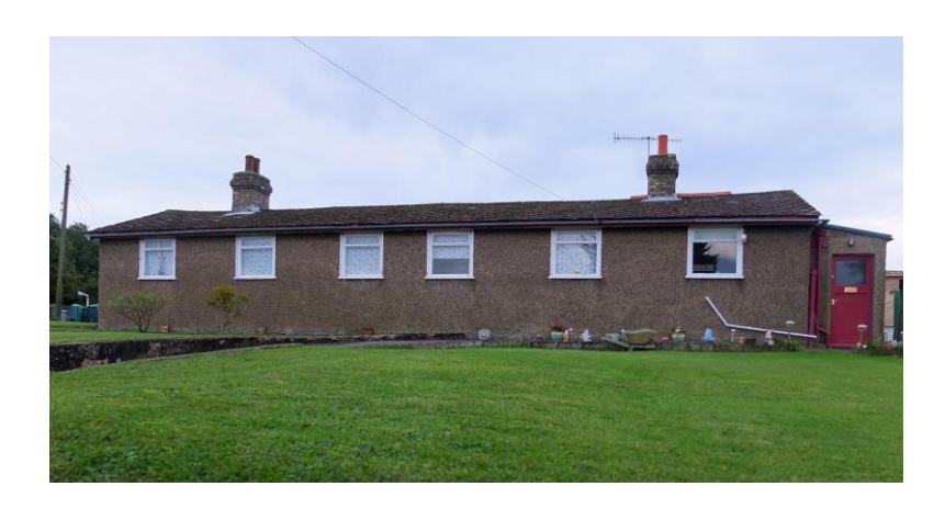
6: The Bungalow in Iffin Lane

Not all the purchasers actually lived on their land at the start. Some, however, used ex-army huts then being sold off by Ministry of Munitions after war, possibly coming a sale at Shornecliffe on 25 February 1920.