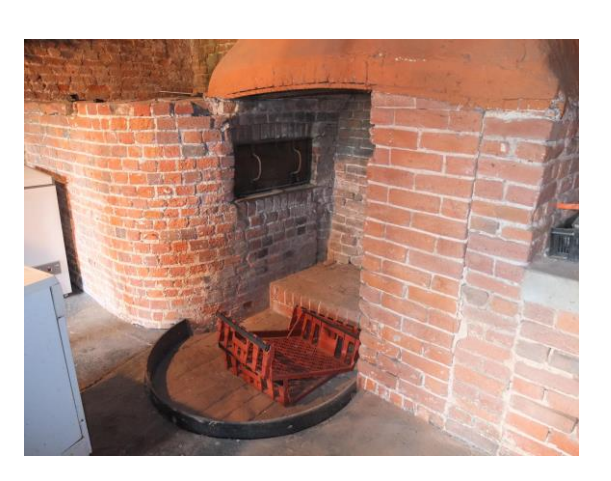
4: New House Farm fireplace