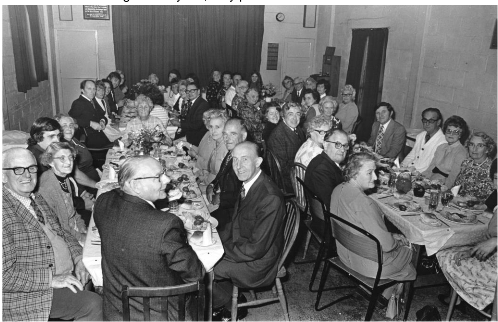
12: The 25<sup>th</sup> Anniversary Dinner in St Faith's