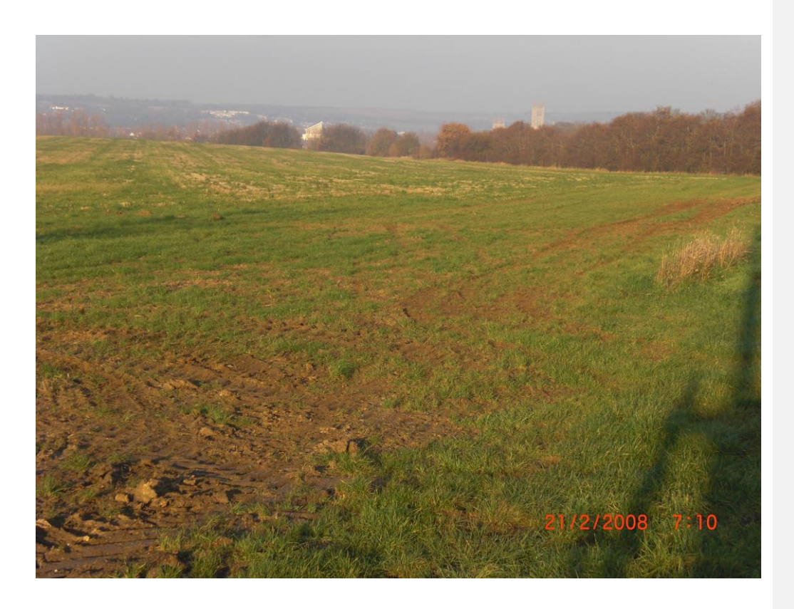
15: A winter view (actually taken in December 2013 despite what the camera claims) of the view from New House Lane to the Cathedral

House Lane and Ashford Road, so as to meet government imposed housing targets, there was an immediate local outcry. Large numbers of residents attended meetings and petitioned the Council against the idea. In the event, the election of the coalition government in May 2010 led to this being set aside. However the threat remained, and developers were regularly sniffing around the area and seeking to nobble its representatives. So the HIMN Group (Hilltop, Iffin, Merton & New House Lanes' Action Group) was set up to enable the Lanes to monitor developments and try and influence them in sensible directions. This has led to an alliance with other Residents' Groups first in southern Canterbury and then across the city. In particular there was resistance to a developer's proposals for a 'New Thanington'. The final picture shows the view from New House Lane towards the Cathedral which residents are so keen to preserve.