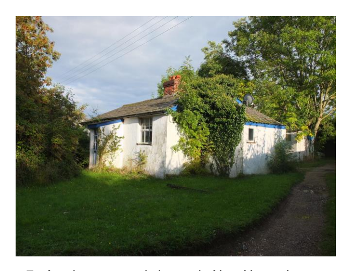
7: Another very early house in New House Lane

Four of these huts were cut in half and then brought up on carts, three going into Iffin Lane ('The Bungalow', 'Fairview' and 'Orchard View'). There was also one in the bottom part of New House Road, which was later replaced as were those in Iffin. More orthodox houses followed in the early 1920s, built by the Southfields, the