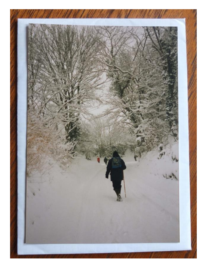
10: Winter in Hollow Lane showing how valuable the high level path must have been