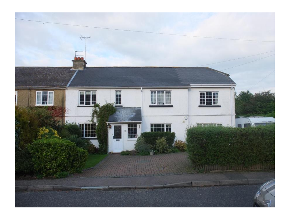
8: A now extended early house from New House Close

Tolputts, the Tuckers (in Greenlands) and, later the Hoares. By 1930 there were about 18 houses in New House Road (as it was initially called), including some in what is now the Close, and rather fewer in Iffin, although this seems to have developed first.