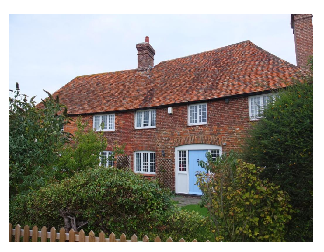
14: Stuppington Development (2)