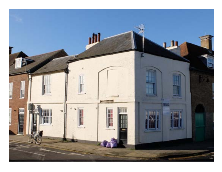
the pub in Union Street in June 2001<sup>21</sup>