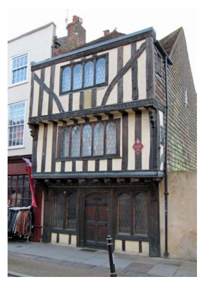
the Tudor House in Palace Street