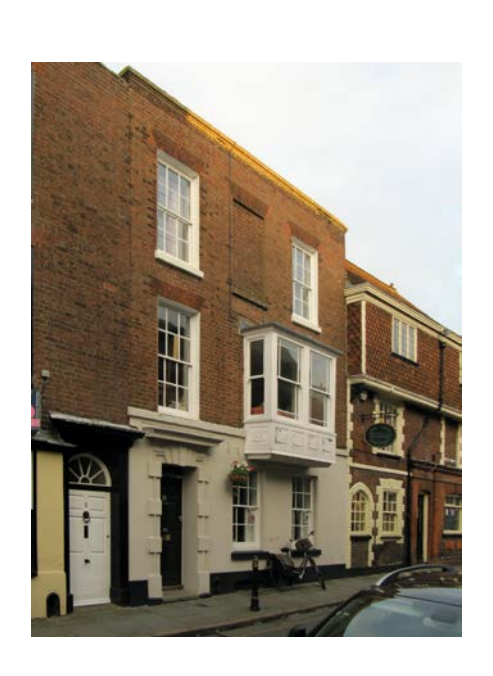
BUF shop and office was here in 1939 (6 St Alphege Lane)